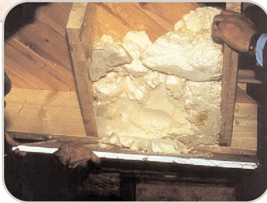
Images of UFFI above courtesy of Carson Dunlop. Copyright 2003, Carson, Dunlop & Associates Ltd.